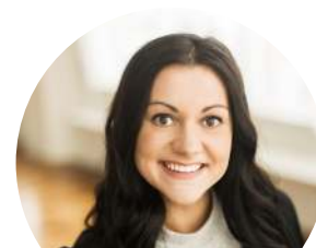
ASSISTANT EVENT SERVICES MANAGER 23 CITY BLOCKS CATERING