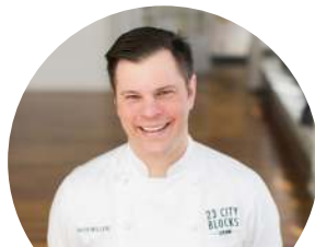
CORPORATE EXECUTIVE CHEF 23 CITY BLOCKS HOSPITALITY GROUP