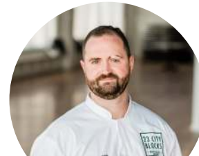
EXECUTIVE SOUS CHEF 23 CITY BLOCKS HOSPITALITY GROUP