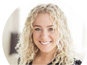
EVENT MANAGER 23 CITY BLOCKS CATERING