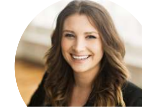
EVENT MANAGER 23 CITY BLOCKS CATERING