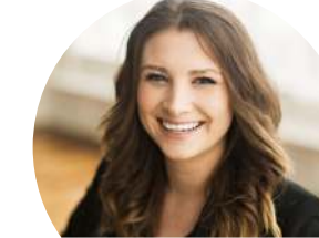
EVENT MANAGER 23 CITY BLOCKS CATERING