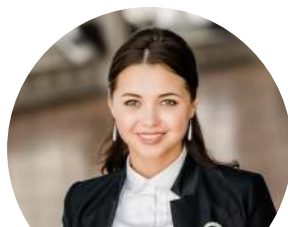
EVENT SERVICES MANAGER 23 CITY BLOCKS CATERING