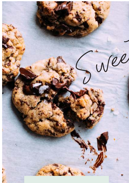
CHOCOLATE CHIP COOKIE

Green Goddess and Balsamic Tomato Vinaigrette