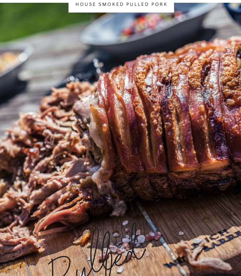
HOUSE SMOKED PULLED PORK