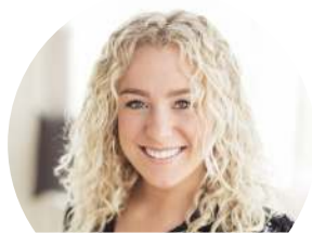
EVENT MANAGER 23 CITY BLOCKS CATERING