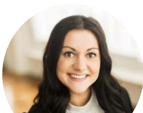
ASSISTANT EVENT SERVICES MANAGER 23 CITY BLOCKS CATERING