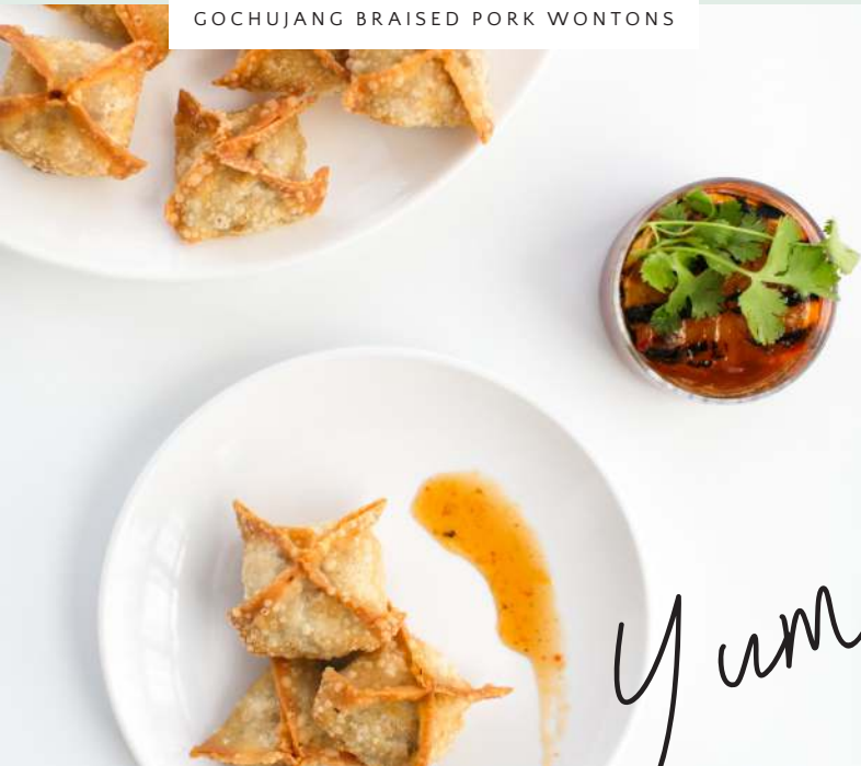
GOCHUJANG BRAISED PORK WONTONS

Tempura Fried Silken Tofu Broccoli, Garlic Ginger Hoisin, Toasted Sesame Seeds