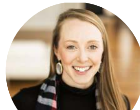
DIRECTOR OF EVENTS 23 CITY BLOCKS CATERING