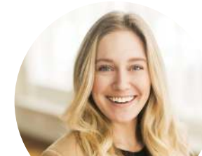
EVENT MANAGER 23 CITY BLOCKS CATERING