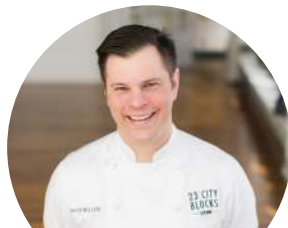
CORPORATE EXECUTIVE CHEF 23 CITY BLOCKS HOSPITALITY GROUP