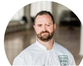
EXECUTIVE SOUS CHEF 23 CITY BLOCKS HOSPITALITY GROUP