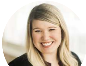
EVENT MANAGER 23 CITY BLOCKS CATERING